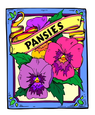
Plants in Pots

If anyone has flowers to spare could you please donate some to the RTC Friday 6<sup>th</sup> April so that we can make some bouquets for our performers.